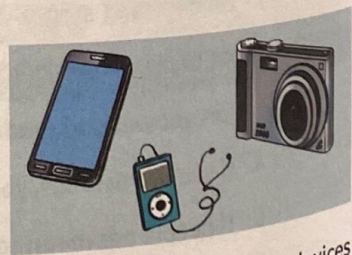
3. _____ devices